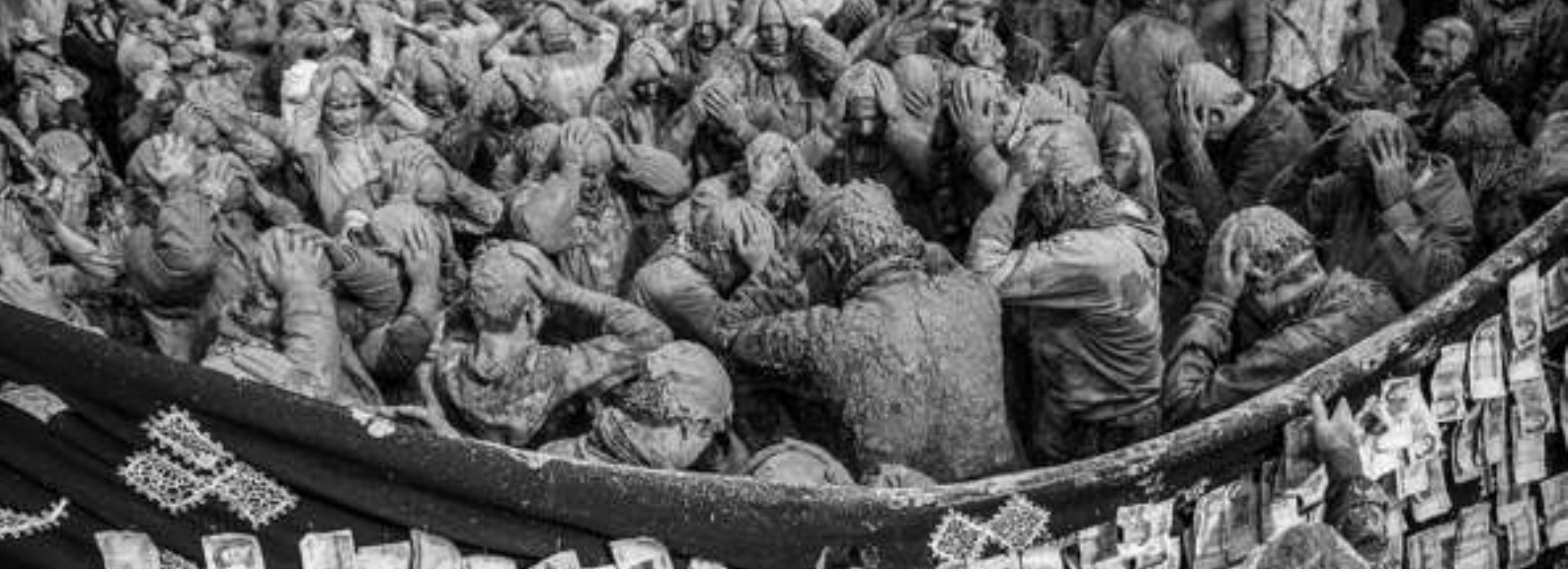
Rafidi swine wallowing in the mud

peer or equal, and that whoever disputes him in any of that is a taghut, just as whoever gives to his opponent that which should be for the imam has committed shirk with Allah ﷻ!