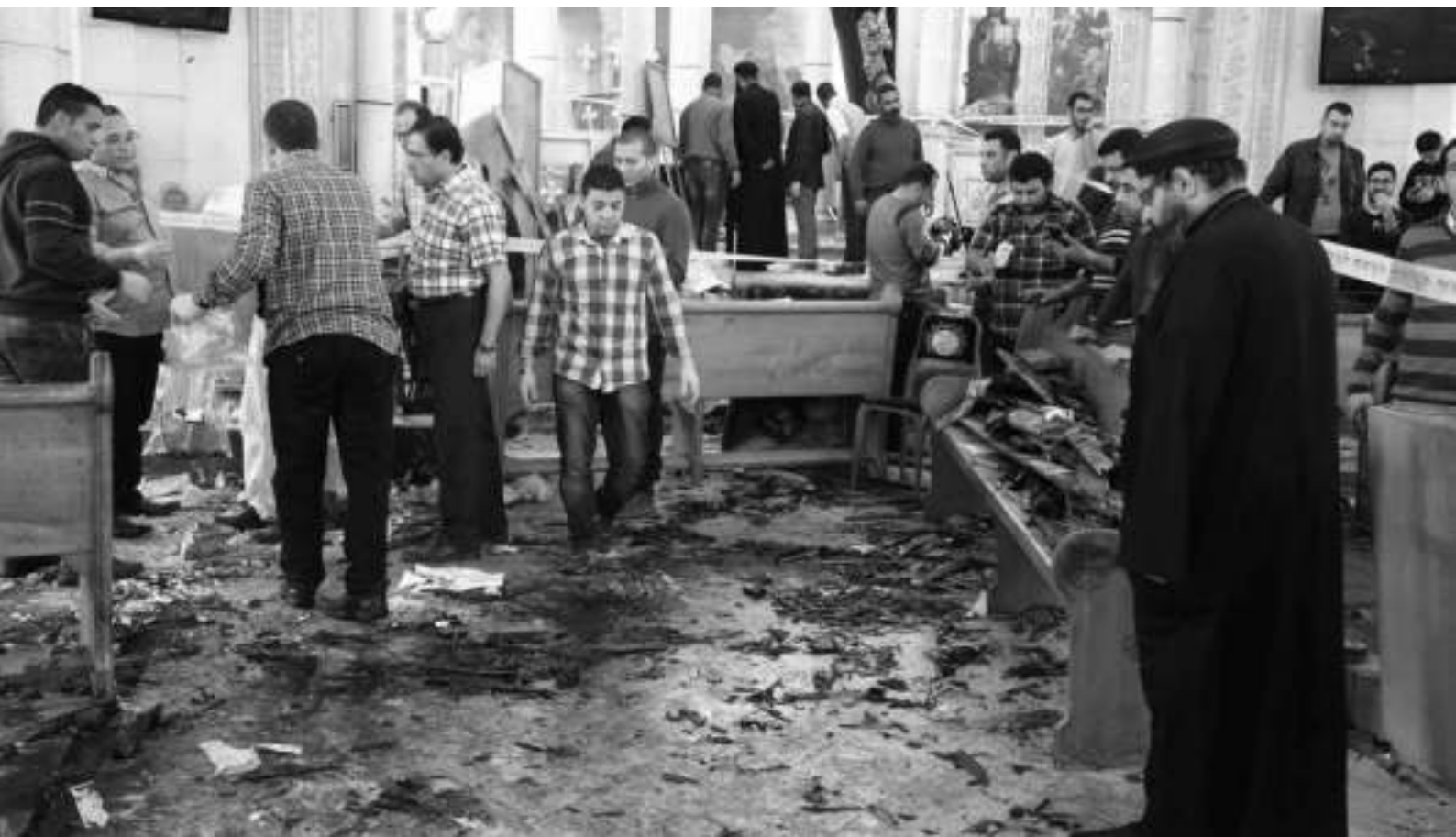
The belligerent Christians of Misr are a target for the mujahidin

Imam Ibn Taymiyyah رحمته الله said, “The monks concerning whom the scholars differed as to the permissibility of killing them and taking jizyah from them are mentioned in the hadith from Abu Bakr as-Siddiq رضي الله عنه , who stated in his orders to Yazid Ibn Abi Sufyan when sending him to lead the conquest of Sham, ‘You will find a people who claim that they have secluded themselves in their monasteries, so leave them and their claim to have secluded themselves for Allah, and you will find a people who have sheared the hair from the middle of their heads, so strike the place where they’ve sheared their hair with the sword, because Allah says, ‘Then fight the leaders of kufr, for indeed, they have no covenant; [fight them that] they might cease’ (At-Tawbah 12). As for the monk who aids the people of his religion with his hand and his tongue, such as one who has an opinion which they seek when