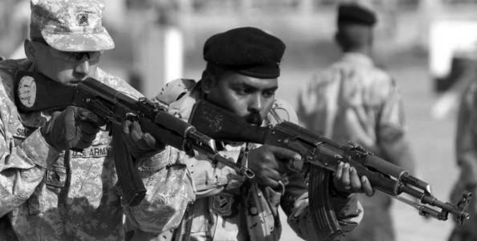
The murtaddin sold their religion to become servants of the Cross

of reward or ghanimah.’ By the One in whose hand is the soul of Muhammad, there is no injury sustained in the cause of Allah, except that it comes on the Day of Judgment in its form when it was sustained: its color will be the color of blood, but its scent will be that of musk. By the One in whose hand is the soul of Muhammad, if it were not a hardship upon the Muslims, I would have never remained behind from a detachment that went to battle in Allah’s cause. But I do not find the provision enough to carry [all of those who would come with me], nor do they find provision enough, and it would be a hardship on them to be away from me. And by the One in whose hand is the soul of Muhammad, I would have loved to fight in the cause of Allah and be killed, then fight and be killed, then fight and be killed” (Reported by Muslim from Abu Hurayrah).