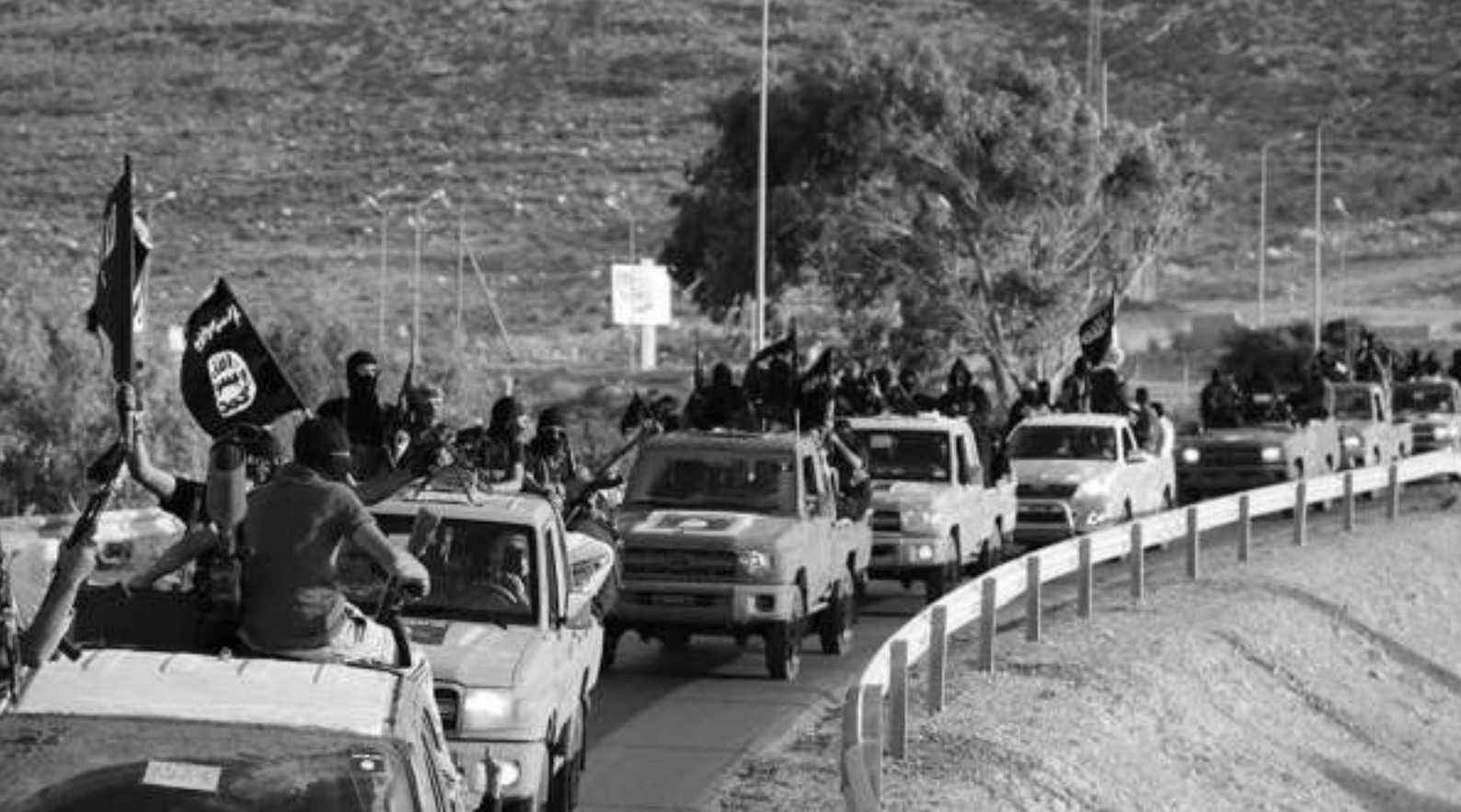
Allah opened the lands to the mujahidin

day you abandon the Kurdish atheists and Sahwah apostates in Sham, so that they meet the same fate as their predecessors in Iraq, by Allah's permission.