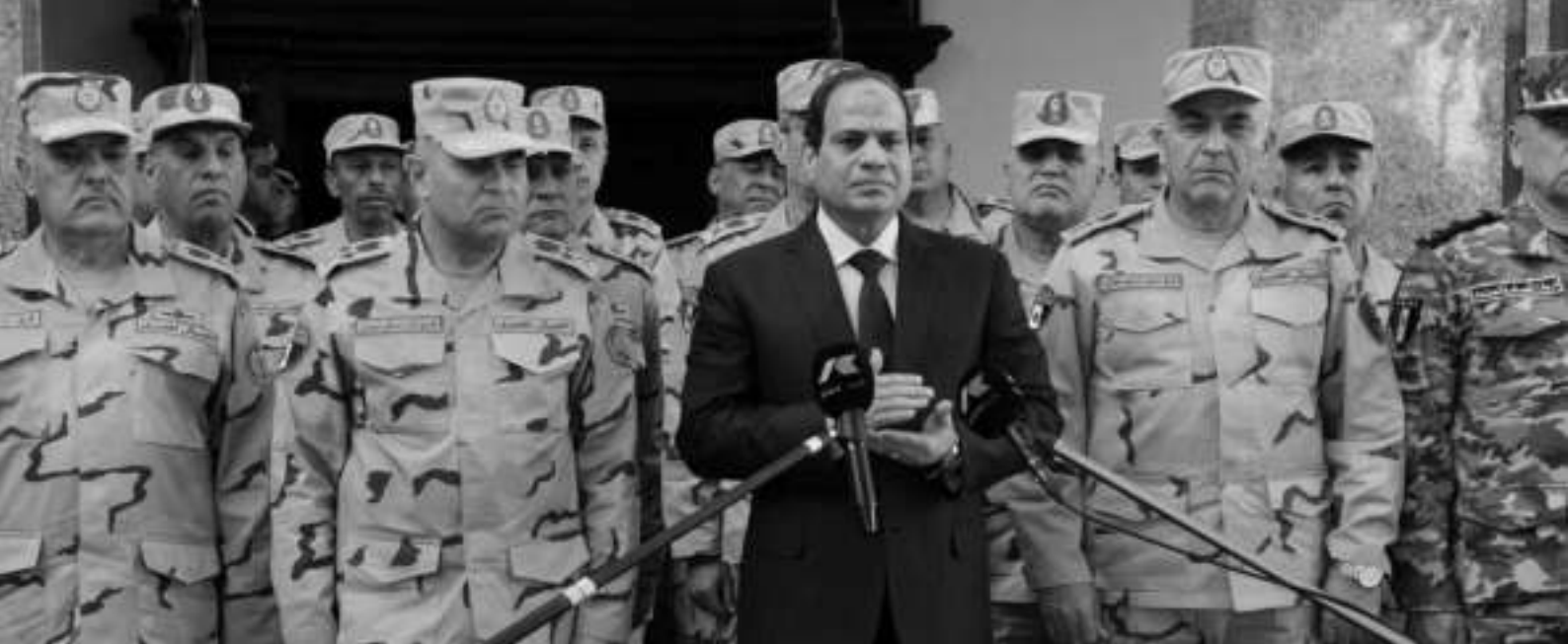
The taghut Sisi and his murtadd forces are allies of the belligerent Christians

Answer: The prevailing trend in many people’s reactions is that of denunciation, as well as disassociation from these operations in specific, and from the war on the Christians and the tawaghit in general, and of offering condolences to these mushrikin on account of what befalls them, under the claim of national brotherhood and the likes, despite that being a show of allegiance to the kuffar and mushrikin, which takes one out of the religion. Whoever does any of that becomes an apostate from the religion of Islam, and his deeds are nullified as long as he does not hasten to repent and show regret before there comes from Allah a day (i.e. the Day of Judgment) which cannot be repelled.