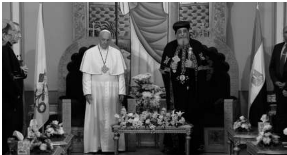
The Christians of the East and the West will be fought until they give jizyah

Question: What is the goal you wish to achieve by targeting the churches?