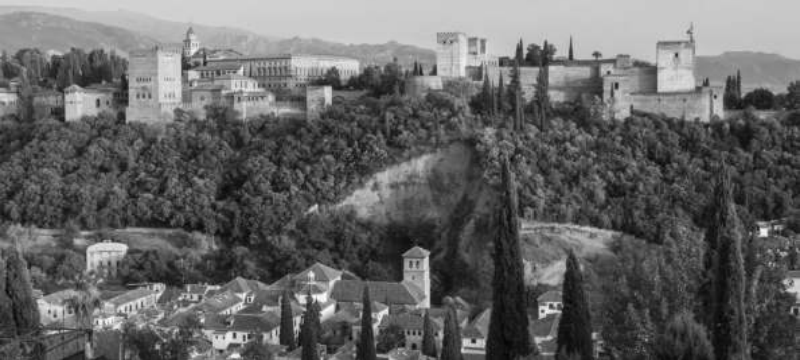
Alhambra, a Muslim fortress in Andalus that fell to the kuffar after the Muslims became divided

one can overcome you; but if He should forsake you, who is there that can aid you after Him? And upon Allah let the believers rely” (Al ’Imran 160).