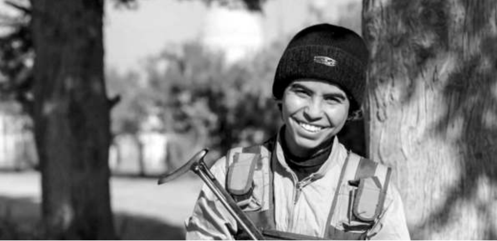
A soldier of the Khilafah who was incited to wage jihad by his mother

lim). Ibn Hajar said, “Nourishing,’ meaning: Suffice them with as much nourishment as will neither burdensomely force them into the humiliation of begging nor contain such excess as to provoke them towards luxury and towards widening the extent to which they engage themselves in the Dunya” (Fath al-Bari).