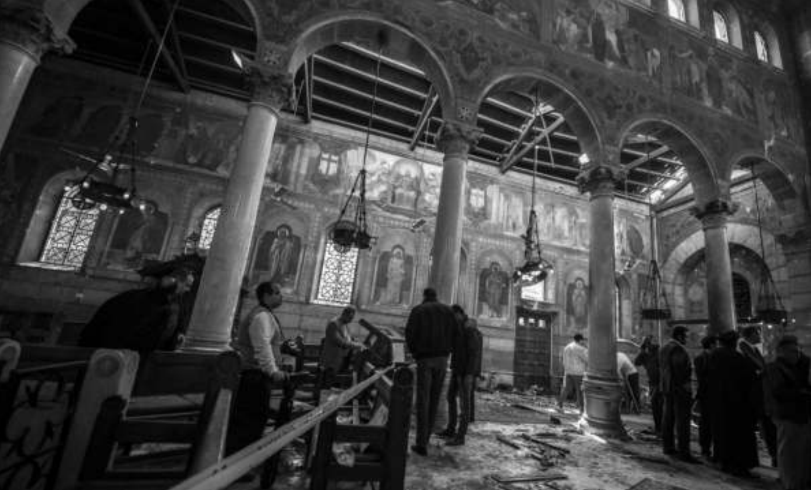
The aftermath of an attack on the belligerent Christians of Misr

indeed its fragrance can be found from a distance of 40 years of marching” (Reported by al-Bukhari), and in the narration of Ahmad and others, “Whoever kills someone from Ahl adh-Dhimmah...” Likewise, there is the statement of ‘Umar Ibn al-Khattab ؓ, “And I counsel you concerning the dhimmah of Allah and the dhimmah of His Messenger ﷺ – that the covenant with them is upheld, that they are defended against the enemy (i.e. the belligerent kuffar), and that they are not burdened with more than they can bear” (Reported al-Bukhari).