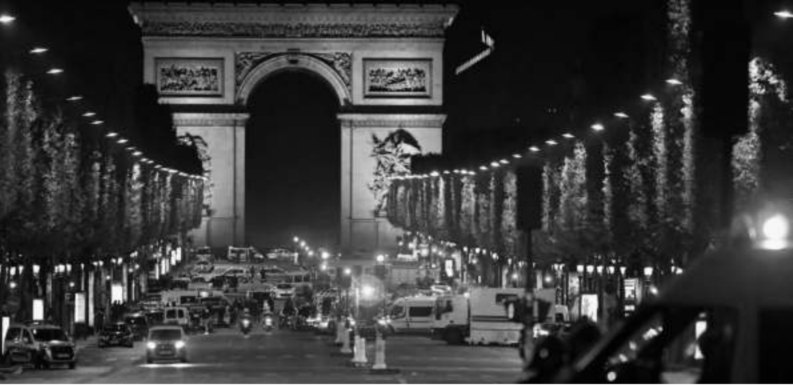
The aftermath of the attack in Paris