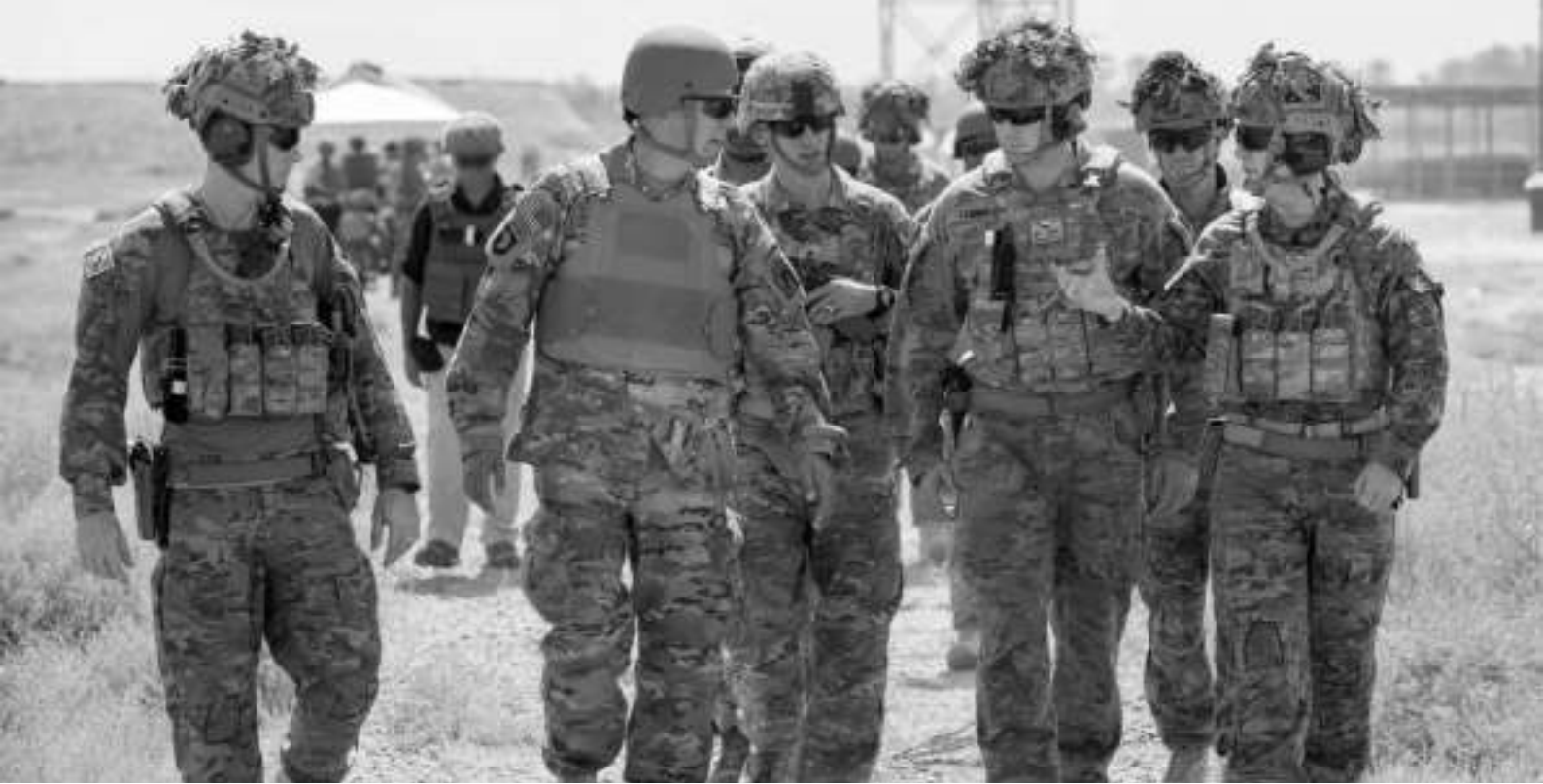
America continues on its arrogant path after many years of spending, fatigue, and misery