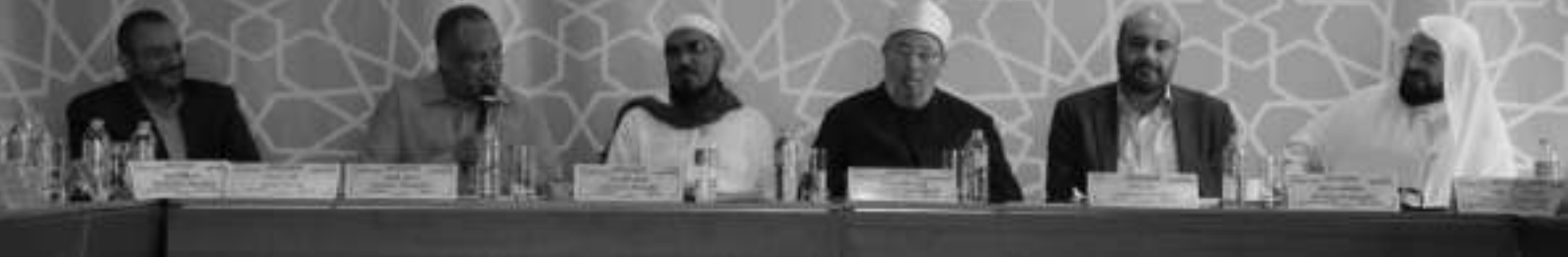
The evil scholars hold a convention to misguide their followers

strike them...’ (An-Nur 63), and he kept on repeating it and said, ‘And what is fitnah except shirk. Perhaps if he were to reject some of his statements there would fall into his heart something of deviance and his heart would become deviated and would destroy him.’ He then began to recite the verse, ‘But no, by your Lord, they will not believe until they make you, [O Muhammad], judge concerning that over which they dispute among themselves’ (An-Nisa 65).