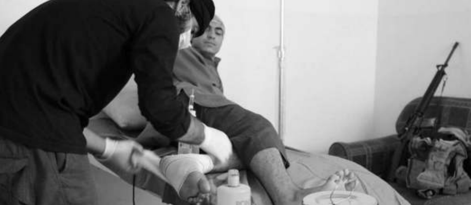
The mujahid for Allah's cause is often tested with injury in battle

jihād will continue as a constant factor on the earth, as he said, “There will not cease to be a group from my ummah, standing by the command of Allah – not harmed by those who betray them or oppose them – until Allah’s command comes and they are as such” (Reported by al-Bukhari and Muslim from Mu’awiyah).